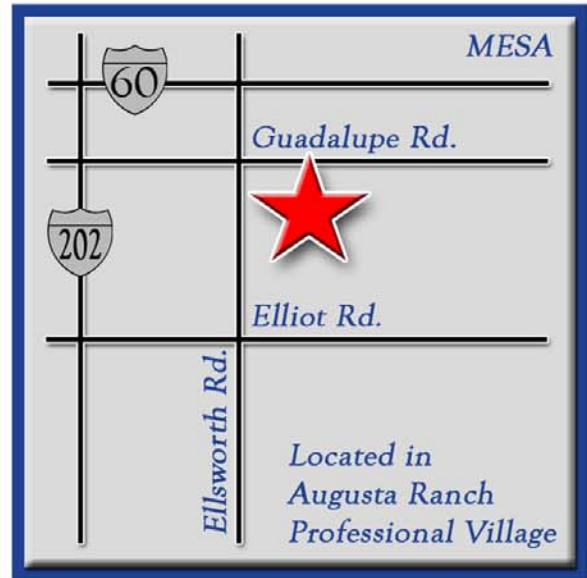
East Mesa Office

312 N Alma School Road, Ste 18 Chandler, AZ 85224