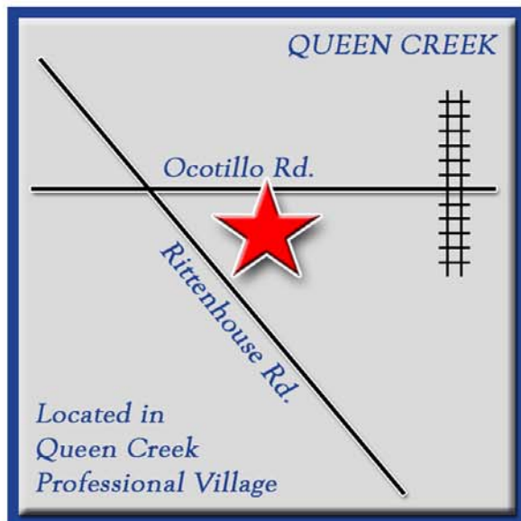
Queen Creek Office

2919 S Ellsworth Road, Ste 102 Mesa, AZ 85212